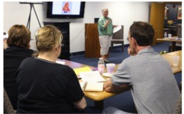
Family, friends, and business associates listening intently at the “Big Dreams” Forum